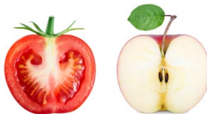
Fruits, like tomatoes and apples, have seeds.

4. The tomato has been called both a fruit and a vegetable. A fruit is the part of a plant that contains its seeds, so tomatoes are fruits. But in 1893, the U.S. Supreme Court ruled that tomatoes are also vegetables, since we eat them like a vegetable.