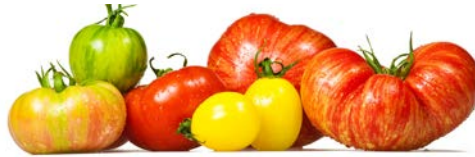
Examples of colorful heirloom tomatoes

9. Store-bought tomatoes today often have thick skin and firm fruit so that they can withstand traveling long distances in large trucks—but they are fairly bland. Old-fashioned heirloom varieties are becoming popular, because they have more flavor.