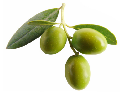
OLIVES AND OLIVE OIL