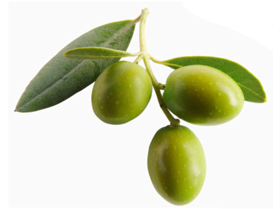
OLIVES AND OLIVE OIL